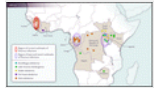
Outbreaks or Episodes of Filovirus Infections.

The recent emergence of Zaire ebolavirus in West Africa has come as a surprise in a region more commonly known for its endemic Lassa fever, another viral hemorrhagic fever caused by an Old World arenavirus. Yet the region has seen previous ebolavirus activity (see map ). In the mid-1990s, scientists discovered Côte d'Ivoire ebolavirus (now known as Tai Forest ebolavirus ) as a cause of a single reported nonfatal case in a researcher who performed a necropsy on an infected chimpanzee. The episode initiated a major research investigation in and around the Tai Forest region — an effort that failed to identify the reservoir of this new Ebola species. Since that incident, West African countries have not reported any evidence of the presence of ebolavirus.