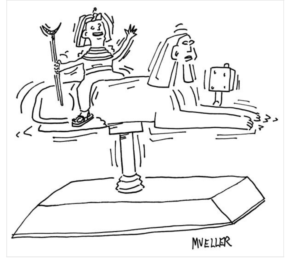
Buy or license »

Shiva and other opponents of agricultural biotechnology argue that the higher cost of patented seeds, produced by giant corporations, prevents poor farmers from sowing them in their fields. And they worry that pollen from genetically engineered crops will drift into the wild, altering plant ecosystems forever. Many people, however, raise an even more fundamental objection: crossing varieties and growing them in fields is one thing, but using a gene gun to fire a bacterium into seeds seems like a violation of the rules of life.