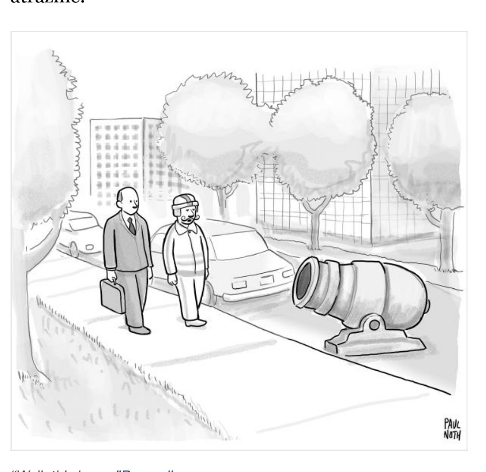
"Well, this is me."Buy or license »

Shiva argues that because many varieties of corn, soybeans, and canola have been engineered to resist glyphosate, there has been an increase in the use of herbicides. That is certainly true, and in high enough amounts glyphosate, like other herbicides, is toxic. Moreover, whenever farmers rely too heavily on one chemical, whether it occurs naturally or is made in a factory, weeds develop resistance. In some regions, that has already happened with glyphosate—and the results can be disastrous. But farmers face the problem whether or not they plant genetically modified crops. Scores of weed species have become resistant to the herbicide atrazine, for example, even though no crops have been modified to tolerate it. In fact, glyphosate has become the most popular herbicide in the world, largely because it's not nearly so toxic as those which it generally replaces. The E.P.A. has labelled water unsafe to drink if it contains three parts per billion of atrazine; the comparable limit for glyphosate is seven hundred parts per billion. By this measure, glyphosate is two hundred and thirty times less toxic than atrazine.