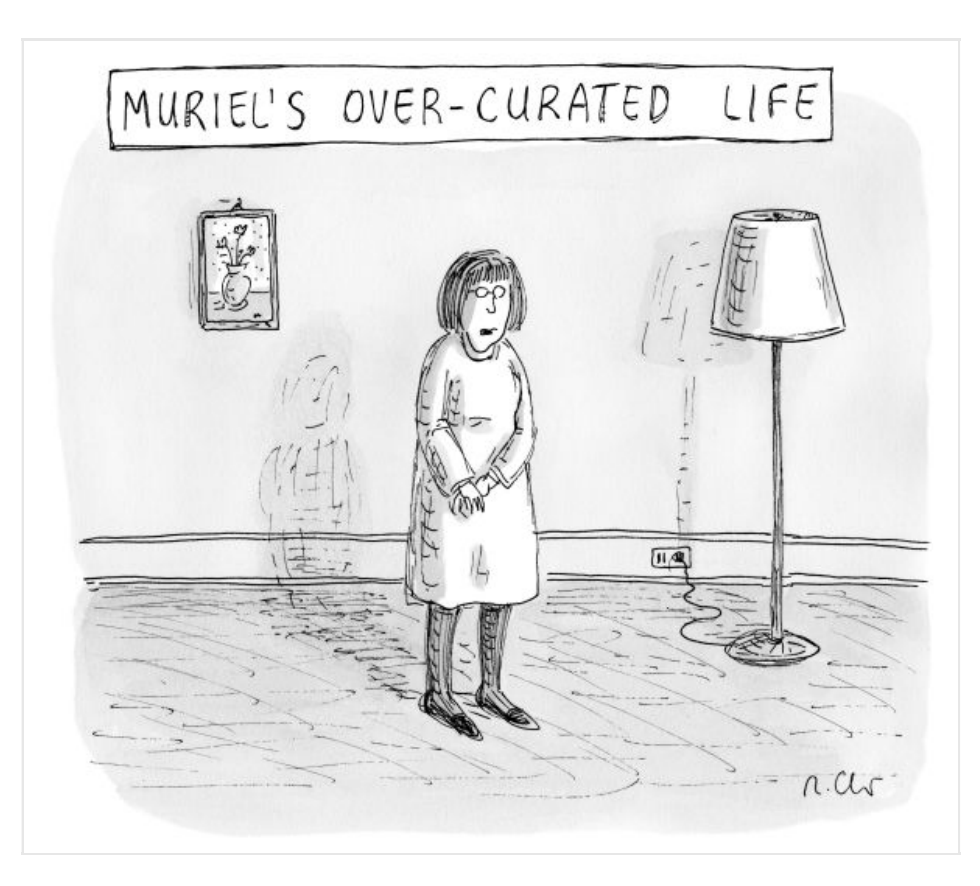
Buy or license »

Those statistics have not deterred Shiva. At the age of sixty-one, she is constantly in motion: this year, she has travelled not only across Europe but throughout South Asia, Africa, and Canada, and twice to the United States. In the past quarter century, she has turned out nearly a book a year, including "The Violence of the Green Revolution," "Monocultures of the Mind," "Stolen Harvest," and "Water Wars." In each, she has argued that modern agricultural practices have done little but plunder the Earth.